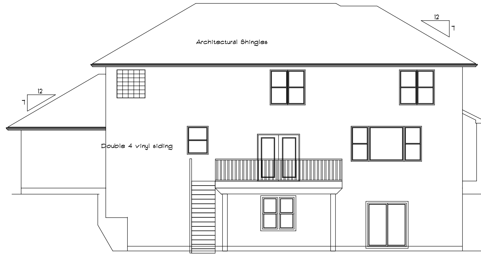
Rear Elevation Scale: 1/8" = 1'-0"