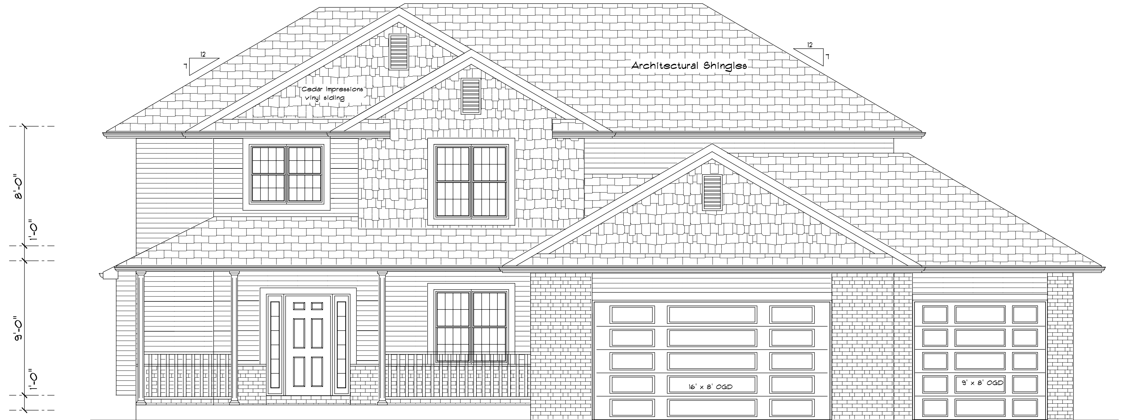
Fairview Front Elevation Scale: 1/4" = 1'-0"